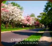
COMPLETE AVENUE PLANTATIONS