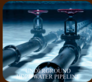
UNDERGROUND WATER PIPELINE