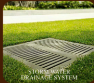
STORMWATER DRAINAGE SYSTEM